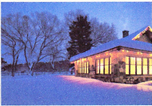
“The activities of the Tri-Lakes Association truly do make YOUR neighborhood a great place to live.”