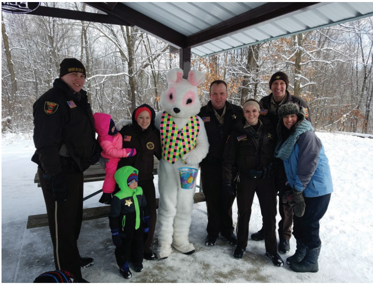
Easter Bunny and Tri-Lakes attendees with Washington County Sheriff's Deputies