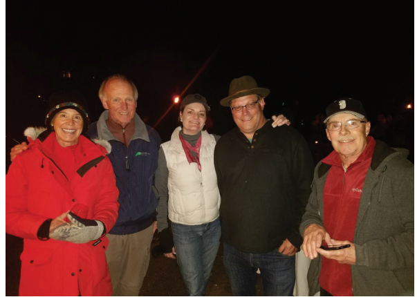
Members enjoying the Family Fall Festival last September