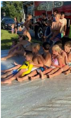
Slip & Slide courtesy of the Lake Elmo Fire Department

Look for details on this summer's program in future communications.